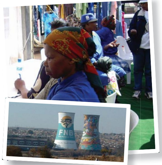
THE HEART OF SOWETO: Patients wait for screening at the Bara taxi rank.

The Heart of Soweto Initiative was set up in response to a growing need for preventing and treating heart disease in bustling Soweto, a densely-populated urban area just south of Johannesburg, South Africa.